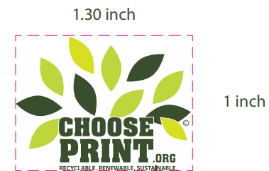
Minimum Size Small Format with tag line

The small format is designed to allow size reduction without compromising the readability of the copyright symbol.