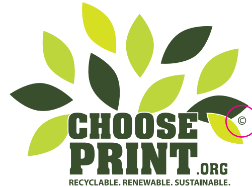
Small Format (sm)

This version should be use when designing poster, billboards or any other large format applications.